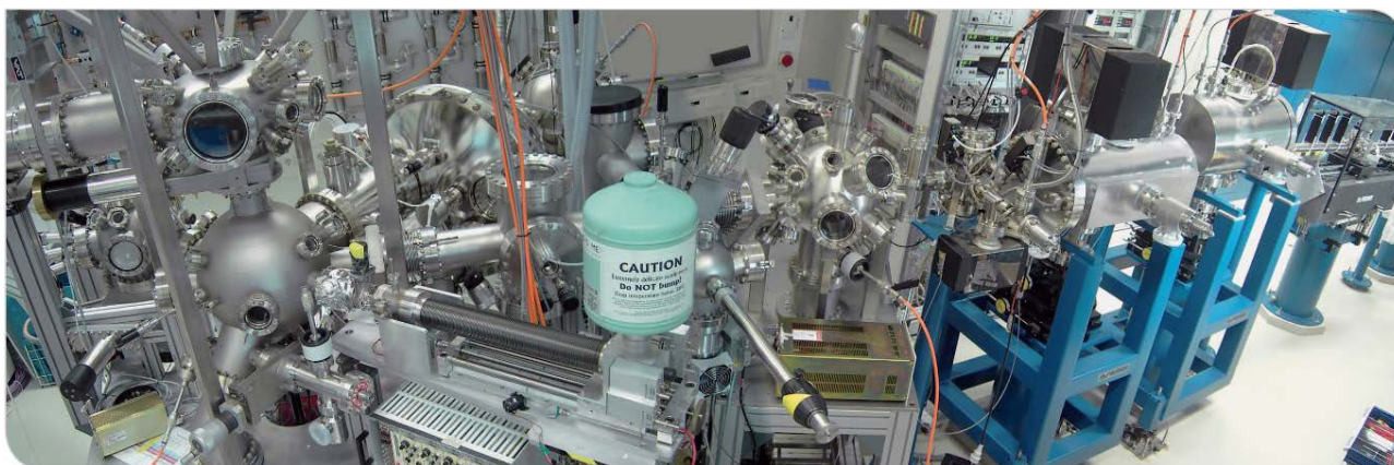
Fig. 1: Part of the cluster of experimental stations, preparation chambers, and loadlocks at WERA. The PEEM is located near the center.

Spectromicroscopy: this is an especially powerful PEEM application: by taking stacks of images while tuning the photon energy or the kinetic energy of the detected electrons, laterally resolved sets of x-ray absorption ( \mu -XAS) and