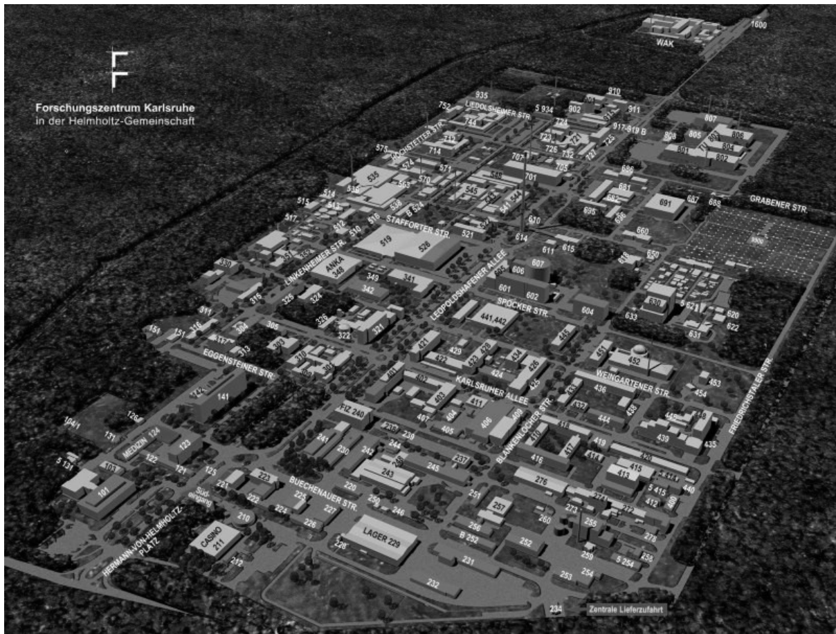
Karlsruhe Nano Micro Facility (KNMF), Forschungszentrum Karlsruhe GmbH, Hermann-von-Helmholtz-Platz 1, 76344 Eggenstein-Leopoldshafen, Germany